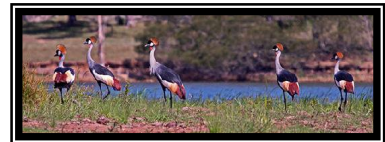
Crested Cranes are a common sight.

Nowadays, Wriggleswade is a hive of activity and many consider it to be the best Bass fishing dam in the Eastern Cape. Having previously been farm land, the dam is full of grassy areas, rock piles, old semi submerged tree stumps and plenty of nooks and crannies where fish love to hide. To date, the record bass caught weighed in at 5.01 kg and the record carp at a massive 20 kg.