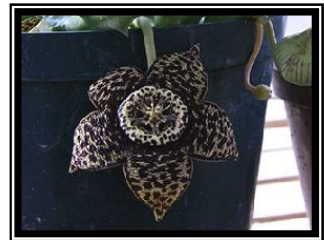
Some succulents bear exquisite flowers.

to have some spare time when visiting Bucksy as they will be only too pleased to take you down to the Krantz and introduce you to the amazing colony of endangered Cape Vultures.