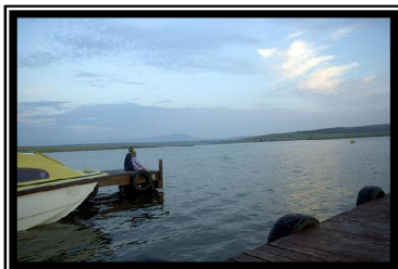
Views of Wriggleswade

Wriggleswade Dam lies just off the N6, the main route from Johannesburg to the coast, and is situated about 25km south of Stutterheim and 60km north of East London. With only a short 12km leg of dirt road in good condition, the dam is easily accessible.