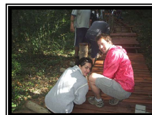
Members of the community working on the boardwalk.